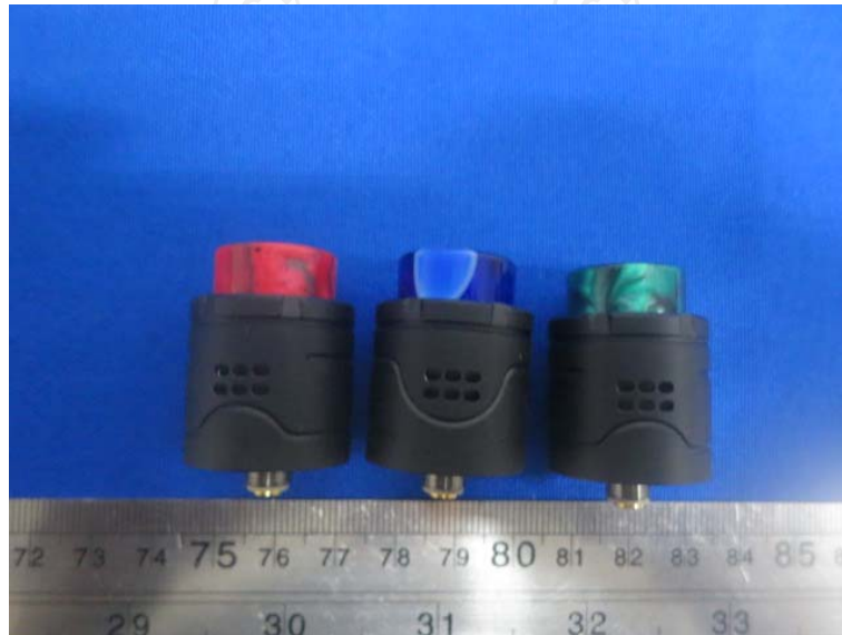
Pulse X BF RDA